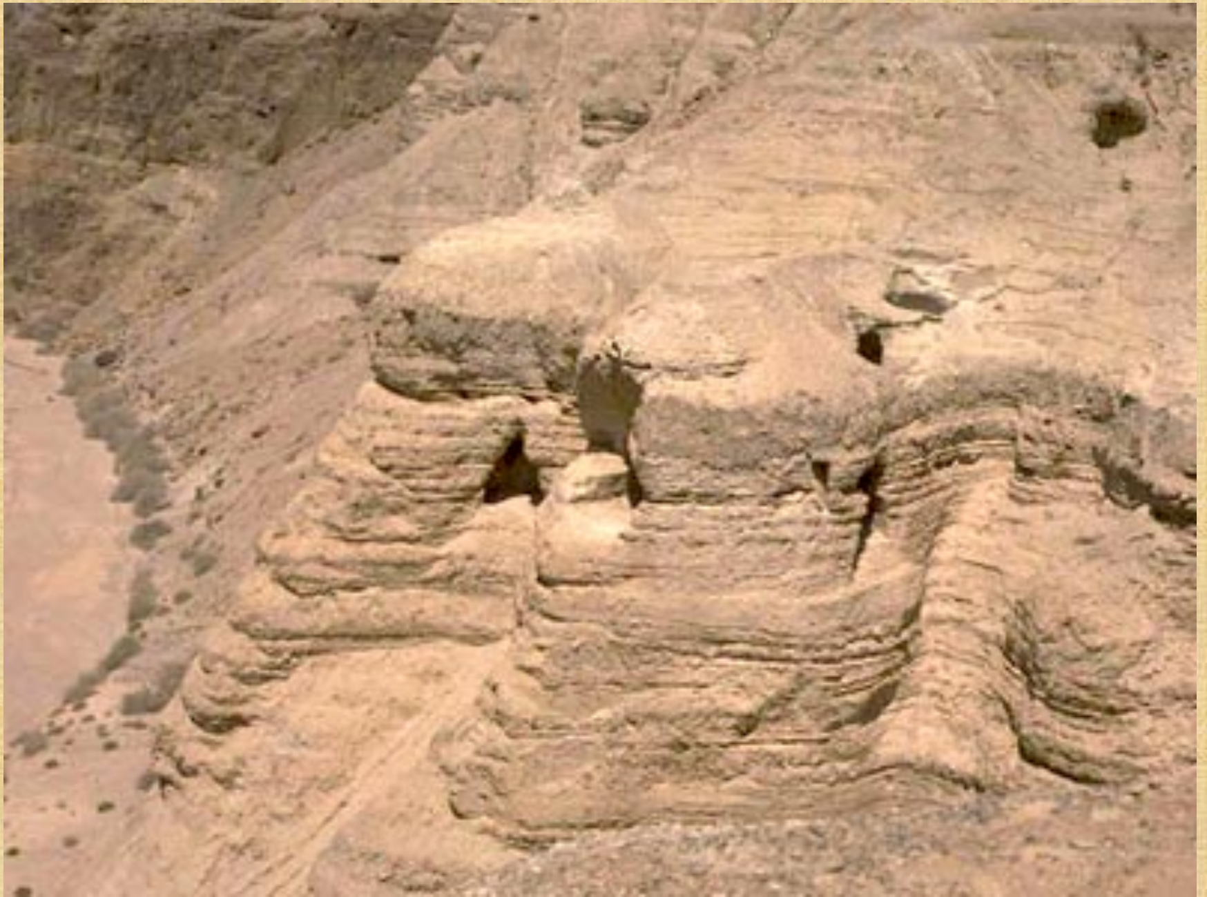
Qumran, site of the Dead Sea Scrolls