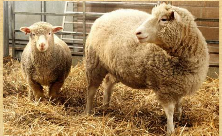
Dolly (right) with another cloned sheep