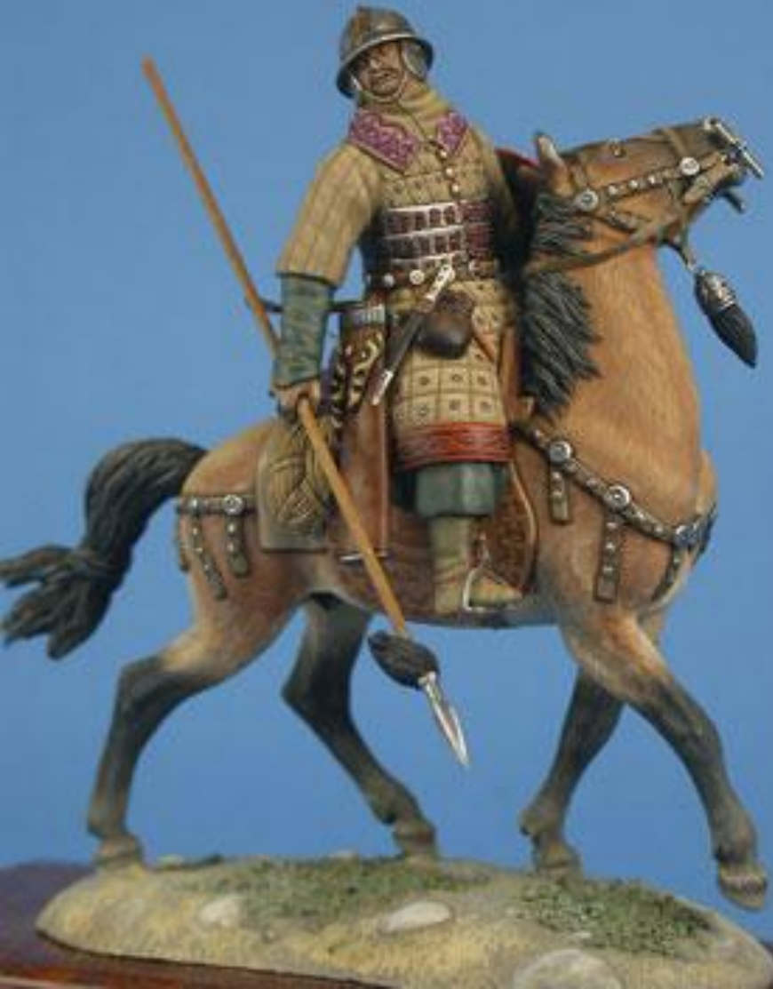
Examples of Mongol warriors