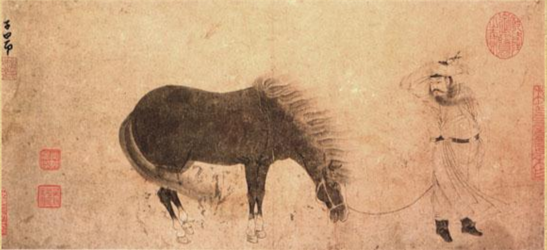
Zhao Mengfu Horse and Groom in the Wind