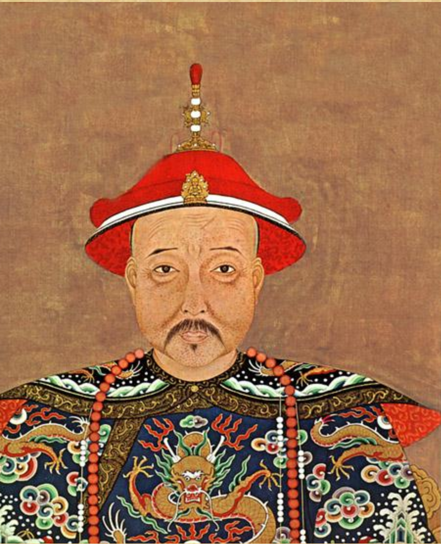
eror of the Qing Dynasty (1662-1722 A.D.).