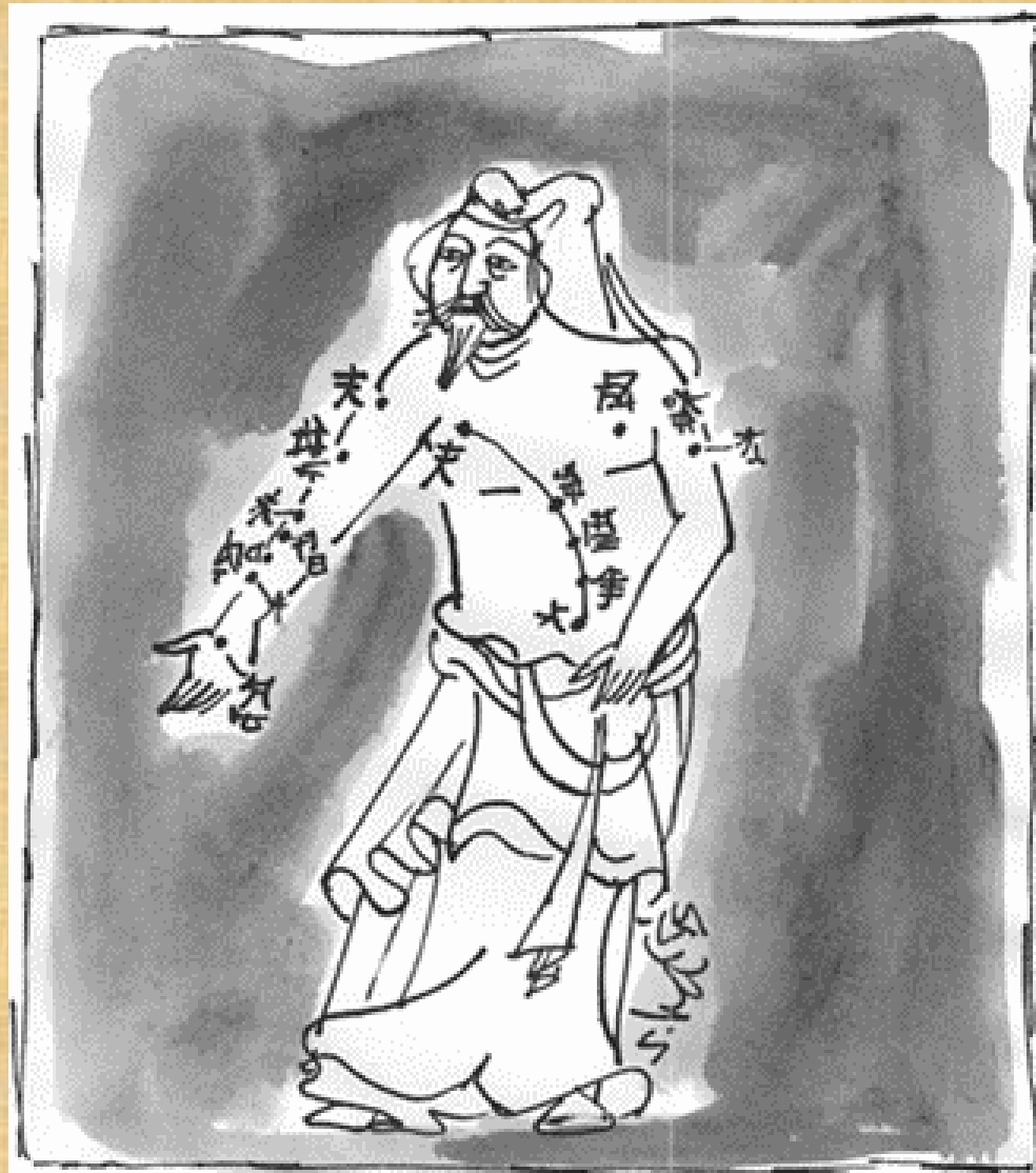
MING DYNASTY ACUPUNCTURE CHART (DISTRIBUTED BY MING DYNASTY BANDAGE CO.)