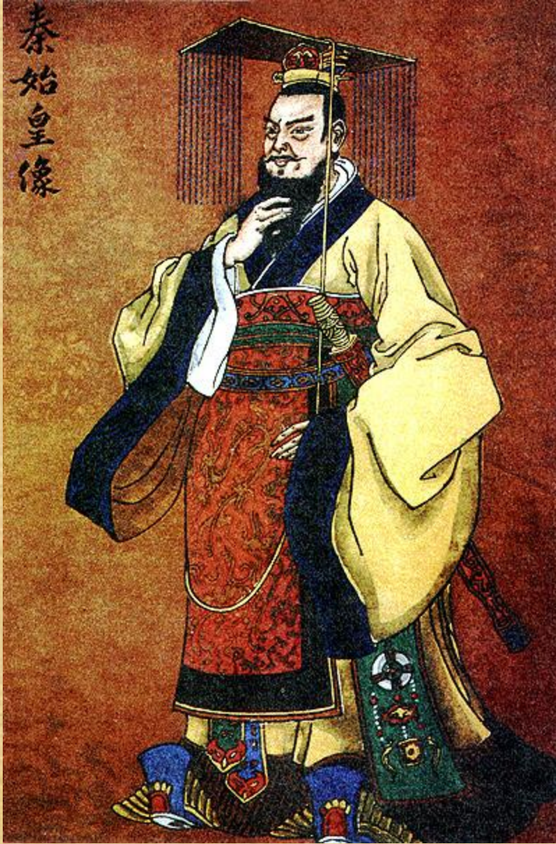
Figure 1: The First Emperor of China: Qinshi (221-210 B.C.).